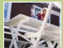
3. Simon Small's house