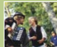
8. Rasmus's barn