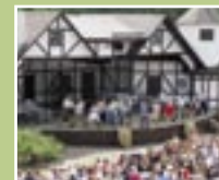
11. Wild Rose Valley