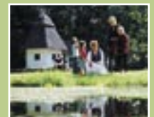
12. Cherry Tree Valley