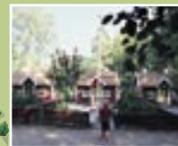
7. Noisy Village