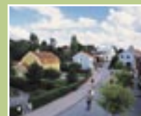
1. Troublemaker Street