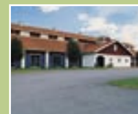
2. Astrid Lindgren Centre