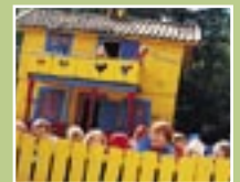
9. Villekulla Cottage