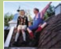
4. Karlsson's roof