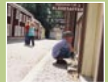
6. The tiny, tiny town