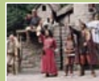
10. Matt's Castle